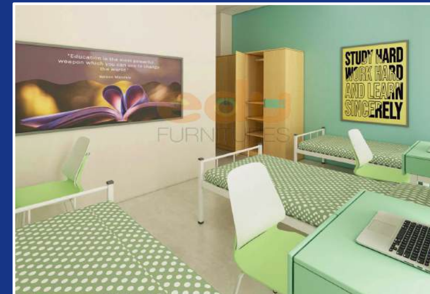
Fully Air Conditioned 300 Beds On-campus Hostel.