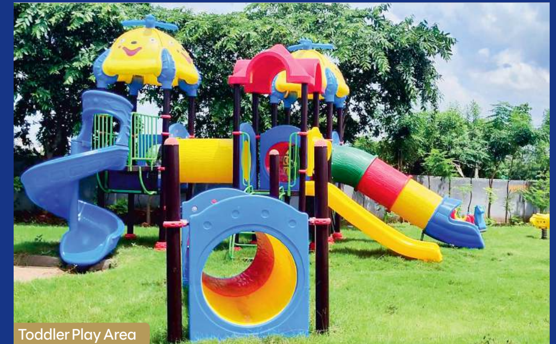
Toddler Play Area

At GDGPSB, we strongly believe in the concept that "All work and no play makes Jack a dull boy". Hence, international standard football fields, lawn-tennis grounds, basketball grounds, etc. are part of our infrastructure, accompanied by expert-level coaches.