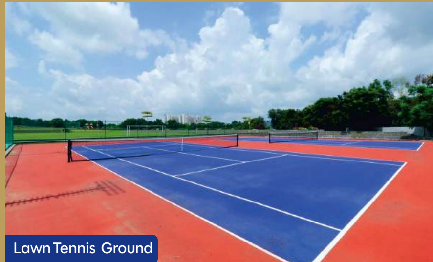
Lawn Tennis Ground