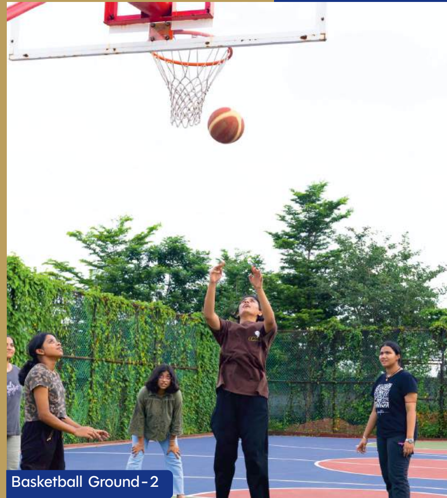
Basketball Ground - 2