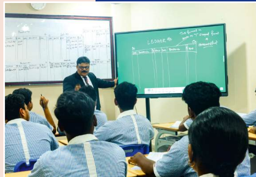
Commerce Smart Class Rooms.