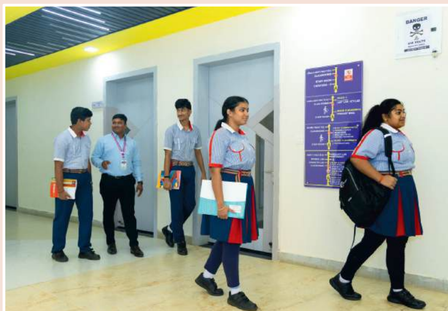
Spacious, well-lit corridors that foster free movement.