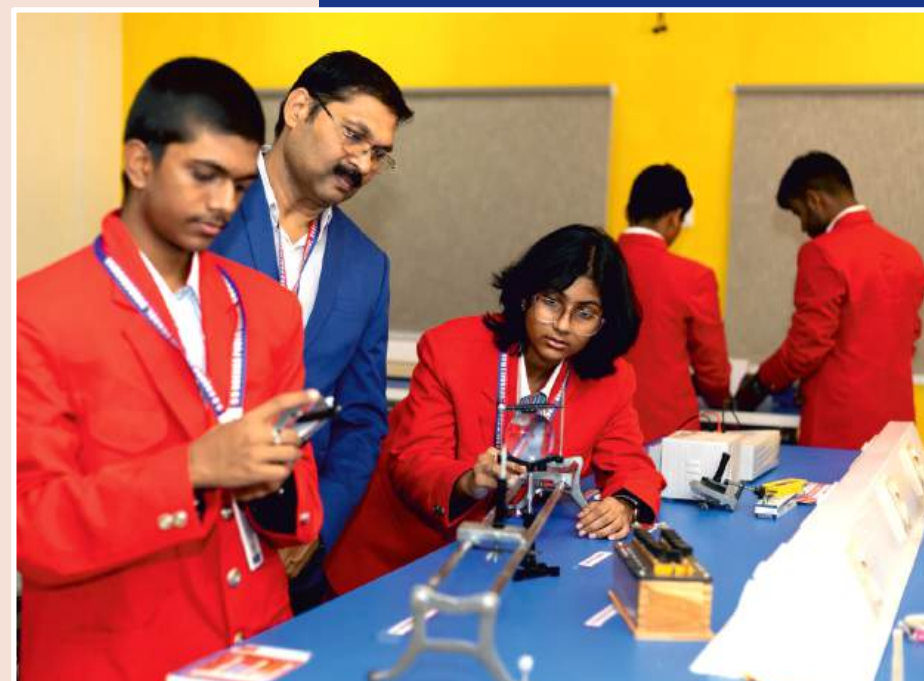
Fully Equipped Physics Lab.