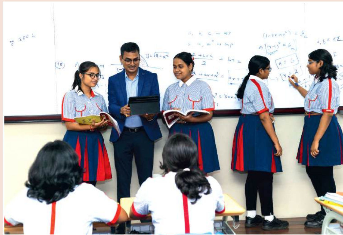
Science Smart Class Rooms.