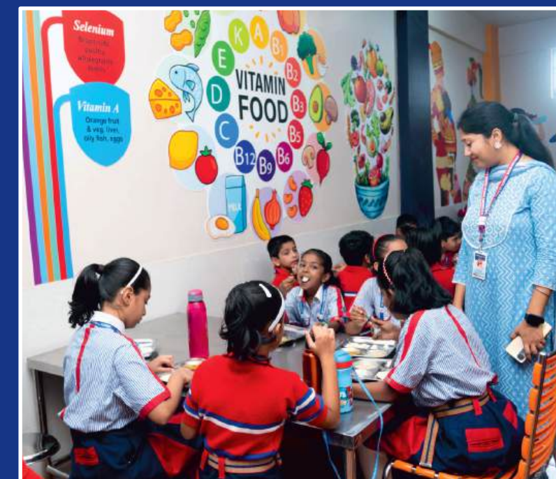
Fully Hygienic Cafeteria with Healthy Food Services.