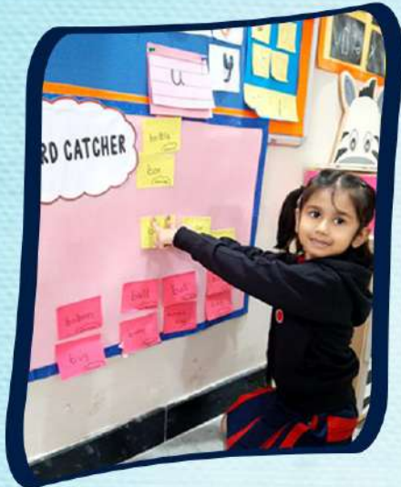
Learning New Words