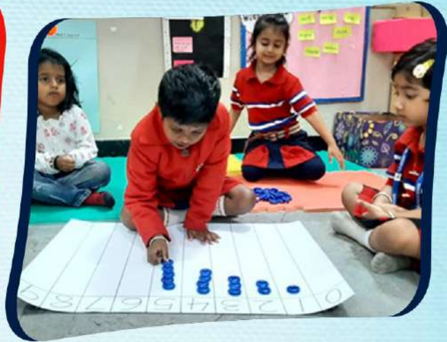
We count and make it more