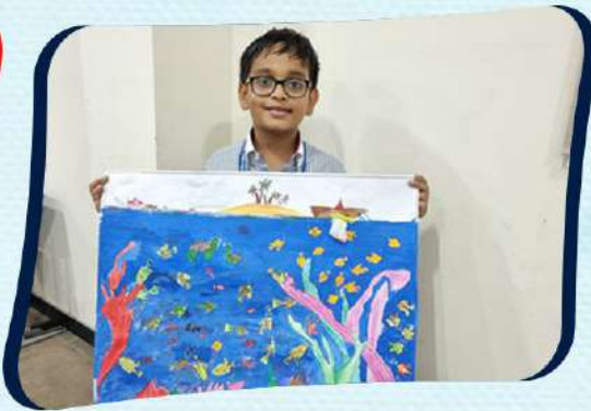
Life under water