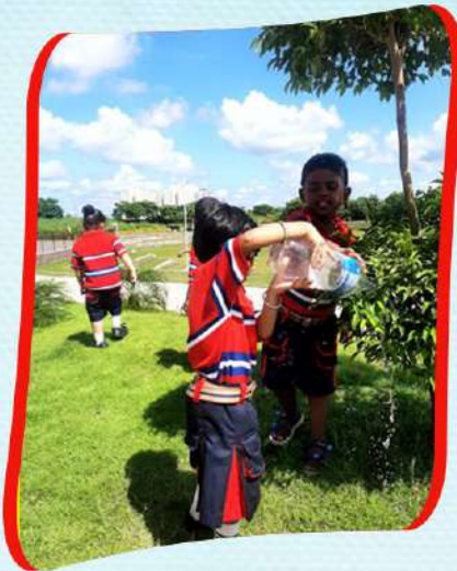
Nurturing the plants