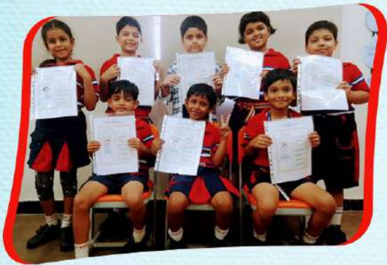
All About me..