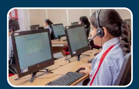
Wordsworth English Language Lab