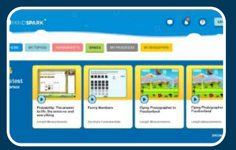
Mind Spark - A Online Math Learning tool