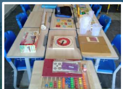
COMPOSITE SCIENCE LAB